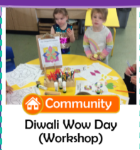
Community Diwali Wow Day (Workshop)