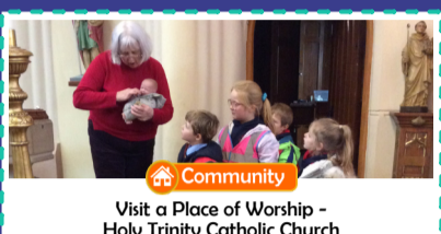
Community Visit a Place of Worship - Holy Trinity Catholic Church