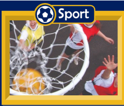
Compete in a sporting event - Netball