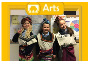
Y3 Mayan Visit