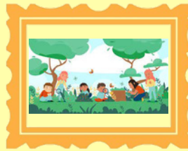
Forest school session