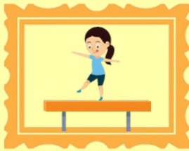
Balance and Beam