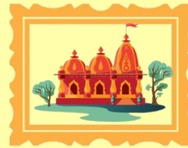
Visiting a place of worship - Hare Krishna Temple