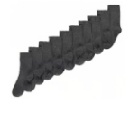
Ankle Socks (Grey)