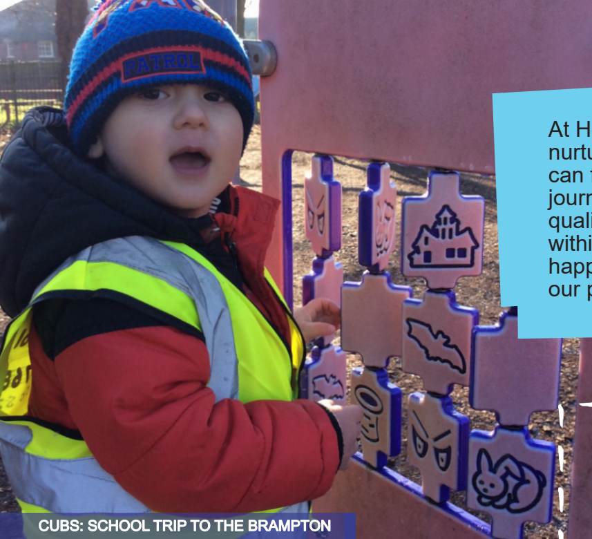
CUBS: SCHOOL TRIP TO THE BRAMPTON

At Hempstalls, we provide our children with a nurturing and safe environment where children can form the foundations for their educational journey. We pride ourselves on providing high quality care to ensure that children settle quickly within their new environment and feel safe and happy. Children's well-being and happiness is our priority.