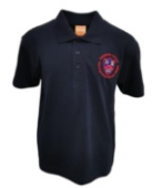
Hempstalls PE Polo

Available From: Smart Uniform From £12.95