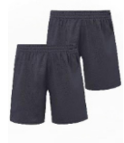
Navy PE Shorts