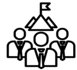
Significant people and places