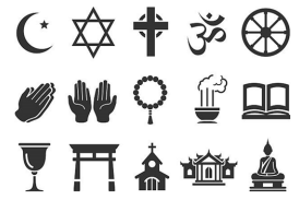
Symbols and Religious Expressions.