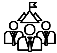
Significant people and places