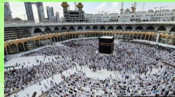
Hajj In Makkah