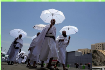
Safa and Marwah