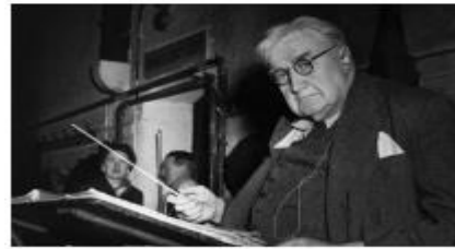
Ralph Vaughan Williams 20th Century

Vaughan Williams was born in Gloucestershire into a wealthy, well connected family. 'Raif' began learning piano at a young age but knew from the beginning that his goal was to be a composer. He wrote his first piece aged just 5 and quickly gave up the piano and took up violin instead.