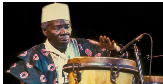
Jin-Go-LaBa (Drums of Passion)