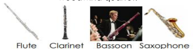
Flute Clarinet Bassoon Saxophone

Written in 1923 – a year that also saw the BBC present its first outside broadcast from the Royal Opera House (Mozart's The Magic Flute ) and the year that Wembley stadium opened to the public – this is one of English composer Ralph Vaughan Williams's most famous works. An orchestra was used for this piece. The woodwind quartet: